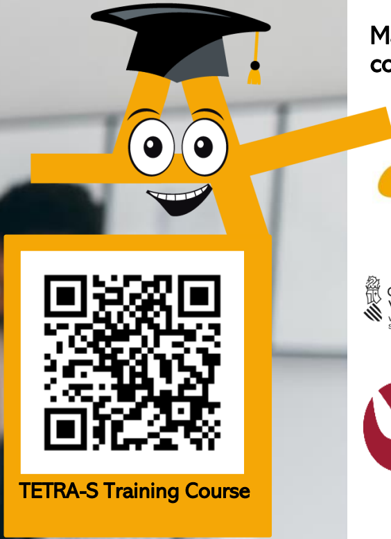
TETRA-S Training Course

"Thank you for being a part of the experience and for staying with us. Let's take a well-earned break and savor a festive lunch together."