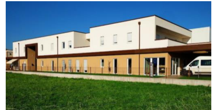
Margherita Cooperativa Venue in Sandrigo (VI), Italy

Our choice of being a Cooperative communicate a desire and a commitment toward social responsibility, the willingness to take care of the frailest people and the sustainable development of our territory.